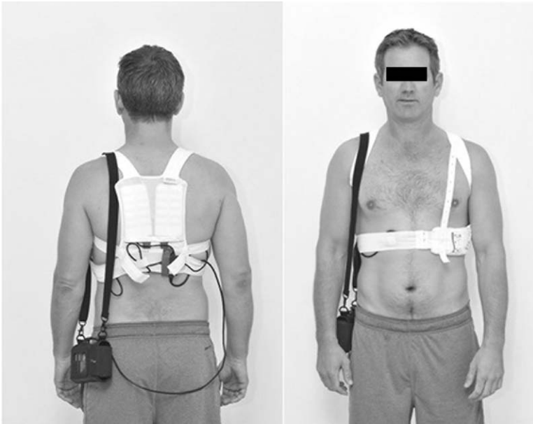
Figure 1. The LifeVest wearable cardioverter-defibrillator.